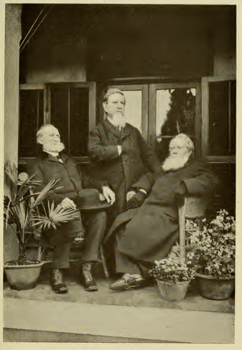
THREE CHINA VETERANS.